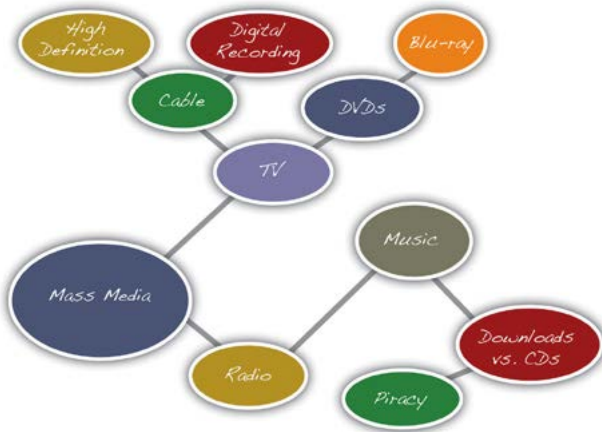
Figure 2.2 Idea Map

Notice Mariah’s largest circle contains her general topic, mass media. Then, the general topic branches into two subtopics written in two smaller circles: television and radio. The subtopic television branches into even more specific topics: cable and DVDs. From there, Mariah drew more circles and wrote more specific ideas: high definition and digital recording from cable and Blu-ray from DVDs. The radio topic led Mariah to draw connections between music, downloads versus CDs, and, finally, piracy.